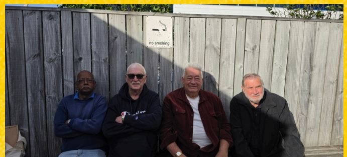
Four wise retirees from the Wellington CT Site. Over 200 years of service and union membership