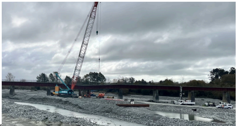
Repair work on the Rangitata rail Bridge in April 2024

The report highlighted a large gap in procedures and staff training. It said the track inspector had received no training in how to inspect a bridge under a river-flow event or to identify signs of scour. Their assessment was based on their historical knowledge, as opposed to a scientific and statistical basis that could have been implemented had a risk-based asset management approach been implemented.